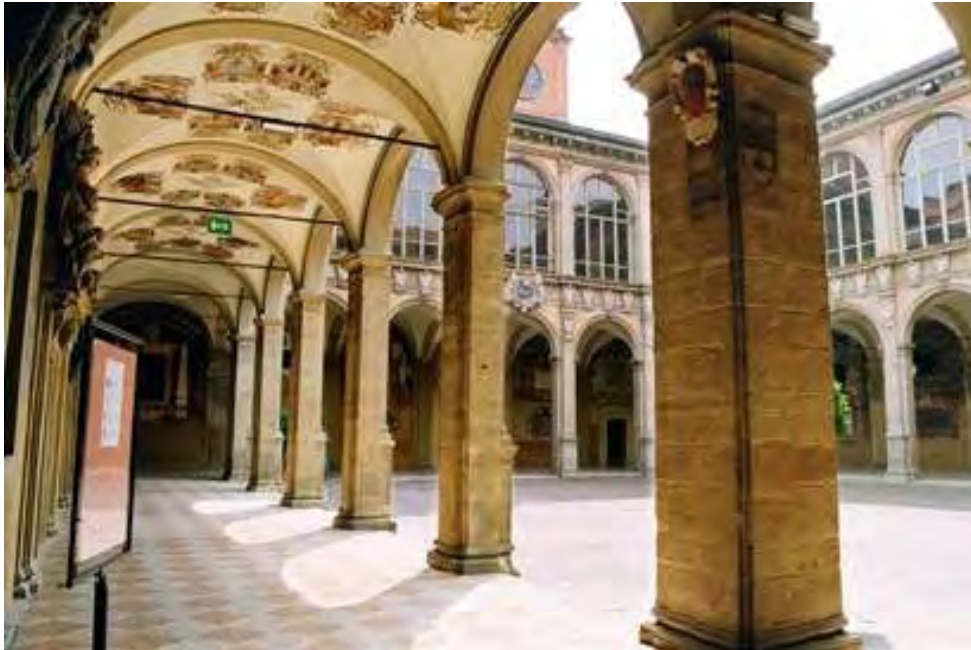
Archiginnasio cloister: the first University premises