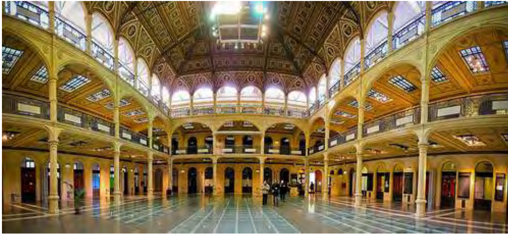
Sala Borsa City Library